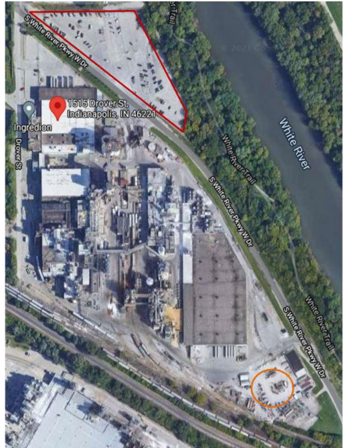
Ingredion Indianapolis Prepared by Trinity Consultants