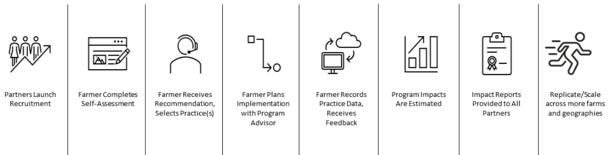
Figure 2. Participation Pathway